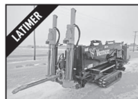
DK2090 '18 Vermeer D23X30 Nav S3 directional boring unit

170+ ITEMS SELL NO RESERVE! THURSDAY, FEBRUARY 16