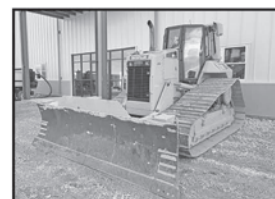
JW9804 '12 CAT D6N LGP dozer