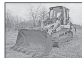
JW9784 '10 CAT 963D track loader

INVENTORY INCLUDES: skid steers, dozers, excavators, track loader, wheel loader, haul trucks, wheeled excavator, crane, vacuum excavator, motor grader, single drum vibratory roller and more. All items are sold "AS IS." 10% buyers premium applies.