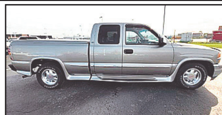
'00 GMC SIERRA #ZH10258A, ONLY 62K!!! $18,900