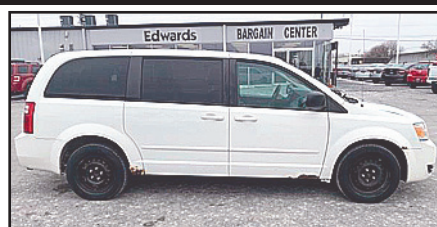
'09 DODGE GRAND CARAVAN #ZN221056A, White $3,564