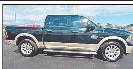
'13 RAM 1500 LONGHORN #ZJ1580B, Laramie, Black $25,900