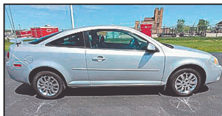
'10 CHEVY COBALT #ZJ1749B, Silver $4,900