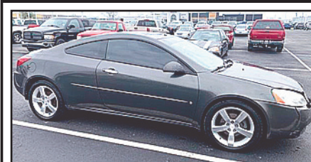
'06 PONTIAC G6 #ZN28809B, GTP, 134K $3,900