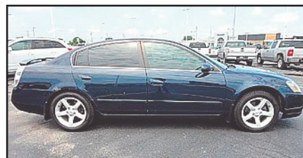
'05 NISSAN ALTIMA #ZN221551C, Blue $4,500