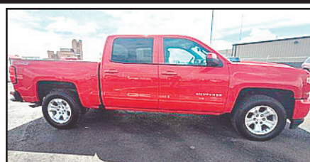
'16 CHEVY SILVERADO #ZC45054A, 100K $29,900