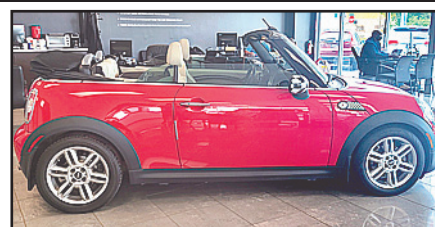
'12 MINI COOPER #ZC12199A, 111K $11,900