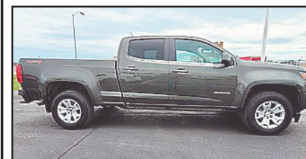
'18 CHEVY COLORADO #ZC45043B, 110K $27,900