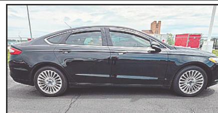
'16 FORD FUSION #ZH10286A, Titanium, 63K $16,900