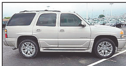
'05 GMC YUKON #ZC44830B, Denali $8,500