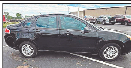
'11 FORD FOCUS #ZK221466C, 90K $7,500