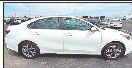
'19 KIA FORTE #ZH10242A, 52K $19,263