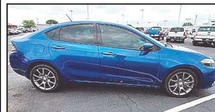
'13 DODGE DART #ZK221651A, Blue $6,900