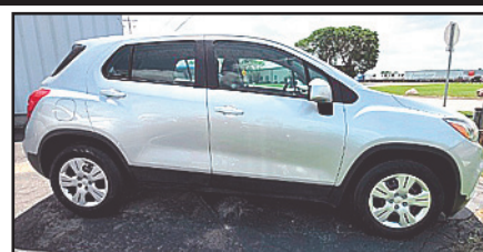
'17 CHEVY TRAX #ZC11902C, 36K $19,900