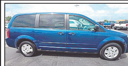
'10 DODGE CARAVAN #ZH10236B, Blue $6,500