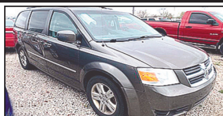
'10 DODGE GRAND CARAVAN #ZK221474A, 137K $5,100