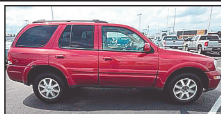
'04 BUICK RAINIER #ZN221723A, 112K $5,900