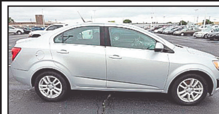
'13 CHEVY SONIC #ZK29513A, 105K $7,900