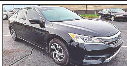
'16 HONDA ACCORD #ZJ1599B, Black $13,900