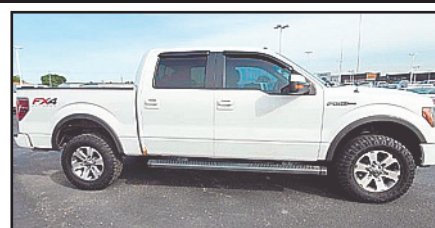
'12 FORD F-150 #ZC45013A, White $18,500