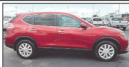
'14 NISSAN ROGUE #ZC12123B, Red $11,900