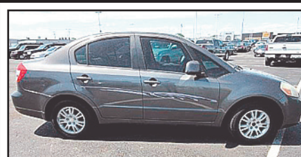
'12 SUZUKI SX4 LE #ZH60317B, Gray $3,900